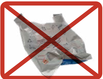
Plastic bags » into the plastic package collection

plastic bags and packages, glass, metal, diapers, hygiene products.