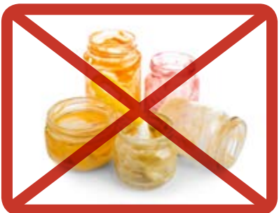
Glass jars » into the glass package collection