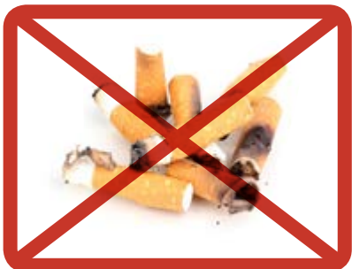
Cigarette butts » into mixed waste